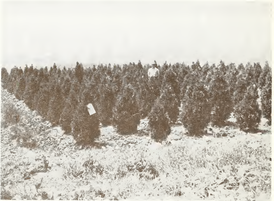
Block of Pyramidalis Arbovitae four to five feet, five to six feet, four times transplanted.